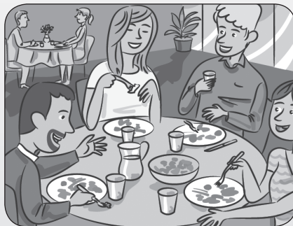
4 social life / popular press