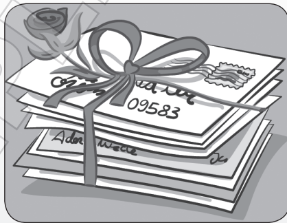
1 love letters / text message