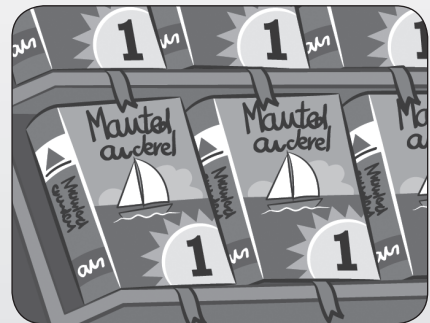
5 audio book / best-seller