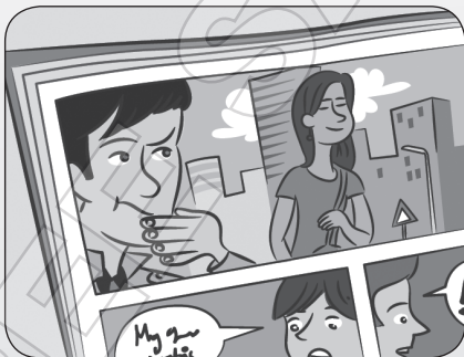
3 book deal / graphic novel